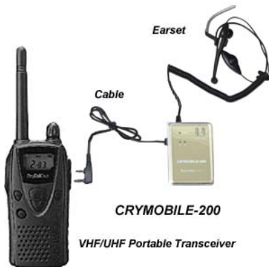
Fig.3. Assemble of CRYMOBILE-200